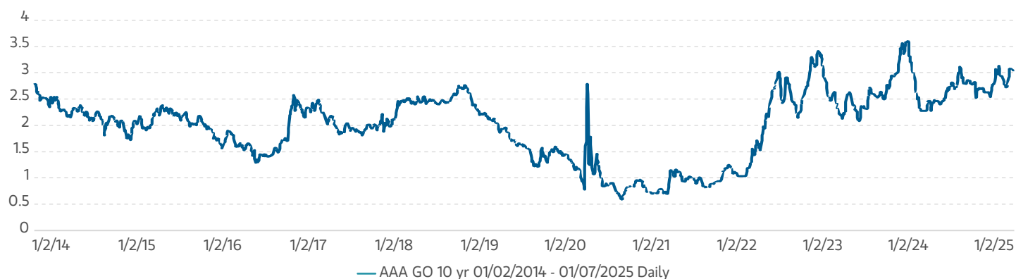
Figure 4. 11 years of benchmark AAA tax-exempt yields, 2014–2025

For illustrative purposes only. Not a recommendation to buy or sell any security. It is not possible to invest directly in an index. Indexes are unmanaged and do not reflect the deduction of fees or expenses. Past performance is no guarantee of future results.